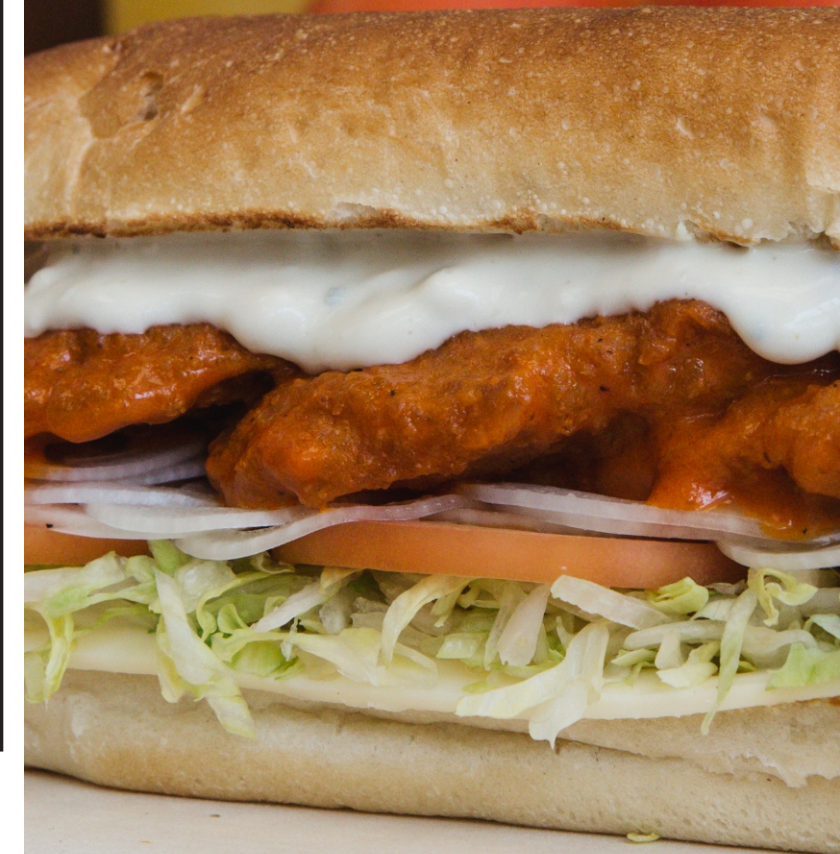
Chicken Finger Sub

2862 Delaware Ave. Kenmore We Deliver Order online at mikes-subs.com