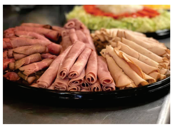
Garnish side tray - Lettuce, Tomato, Onions, Mike's Hot Pepper relish or Banana Pepper Rings sm $9.99, Lg $17.99